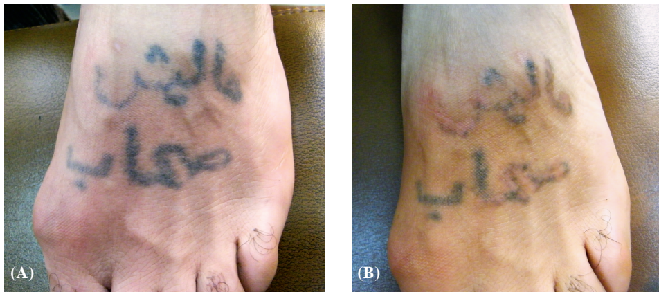
Fig. (2): Patient with mild improvement after 4 sessions (A, Before) (B, After) laser therapy.